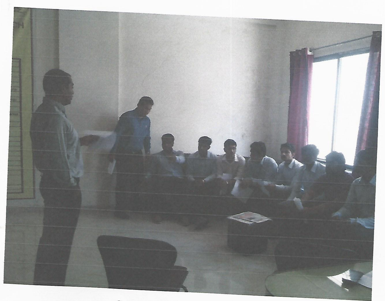
Career Counseling Session-GTT