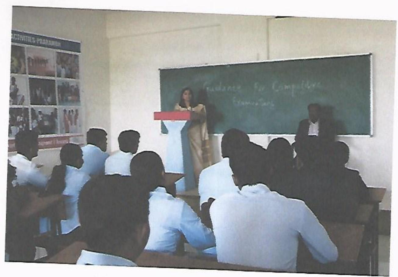
A Session on Competitive Examination