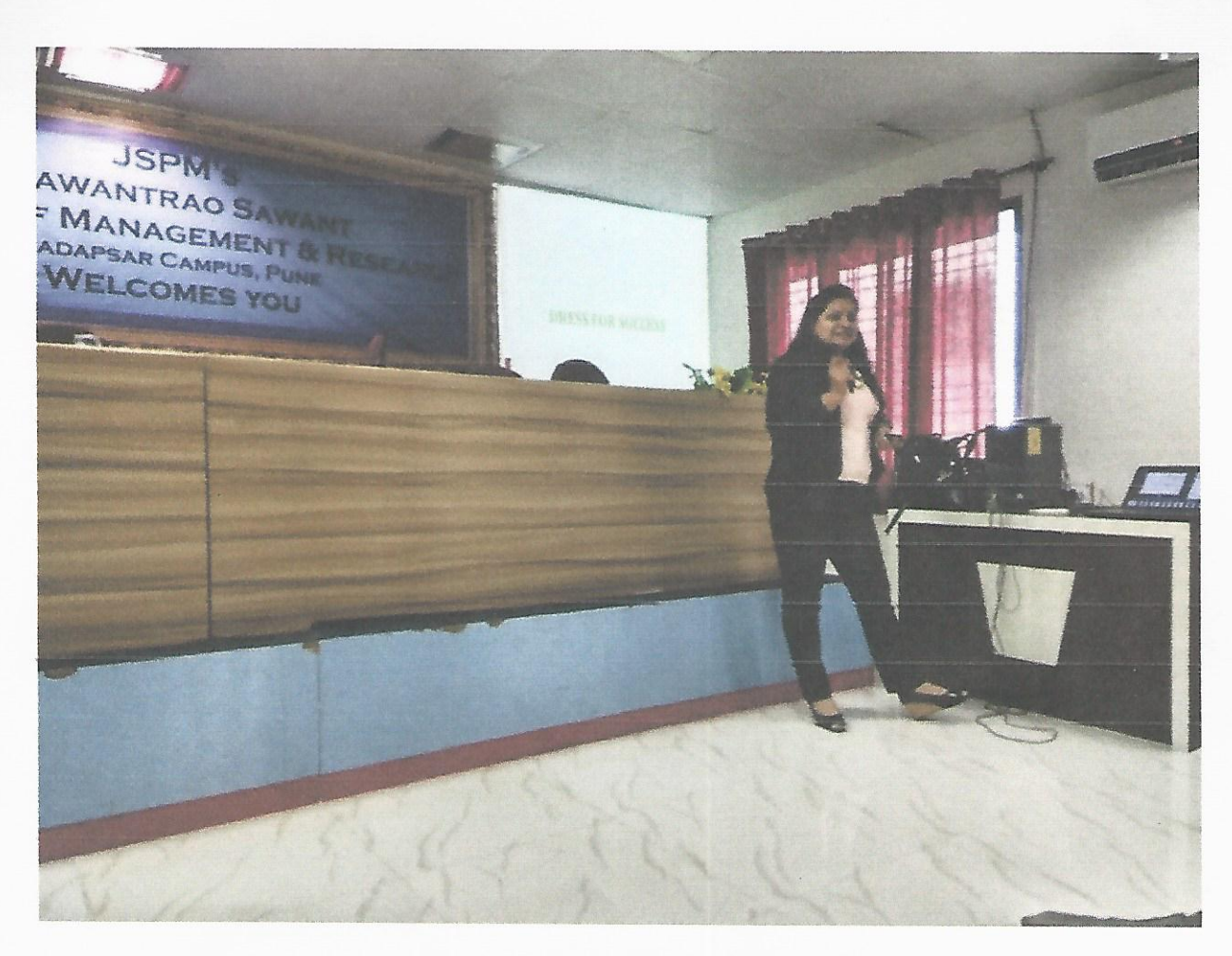
Career counseling session in progress